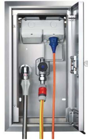
KEMPER 'Tresor' Figure 210, (H / W / D: 470 x 250 x 120 mm)