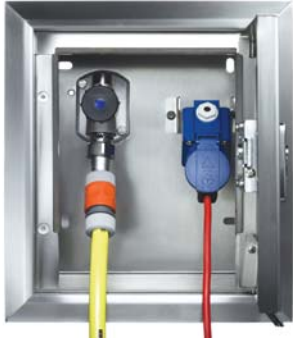
KEMPER 'Mini-Tresor' Figure 211, (H / W / D: 340 x 300 x 120 mm)