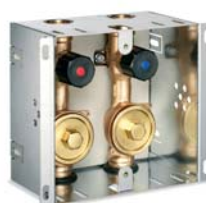
Figure 870 07