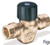
Figure 131 00