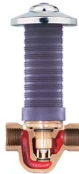
Figure 540 02