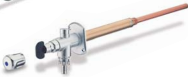
Figure 576 02