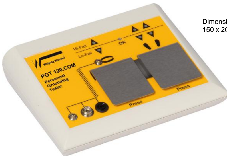
Dimensions: 150 x 200 x 65 mm