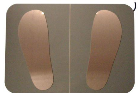
Picture: Footwear electrode for separate shoe testing (350 x 500 x 8 mm)